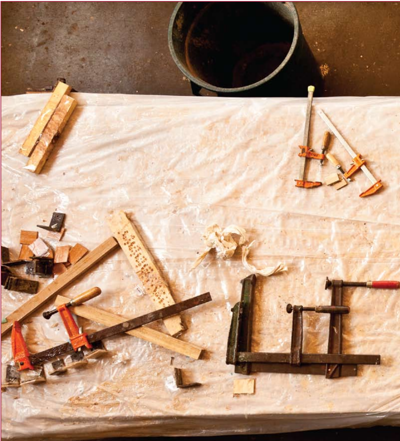
IYRS MUSEUM OF YACHTING 449 THAMES STREET, SUITE 111 NEWPORT, RHODE ISLAND 02840